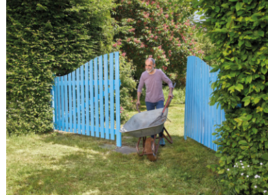
Give your gate a fresh new colour