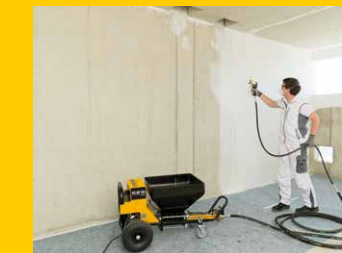
Filler application on construction sites