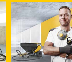
Paint applications on walls