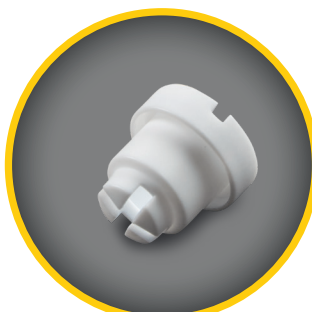
X-nozzle C4 F1-X