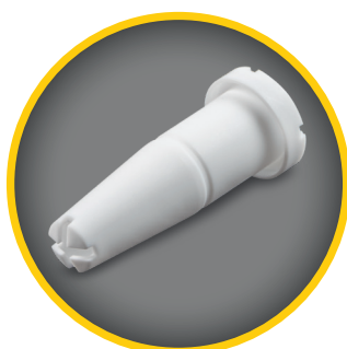
X-nozzle C4 F5-X

The X1 F5 nozzle, 5 cm longer than the standard nozzle, can also be used as a short nozzle extension, which is extremely practical when coating smaller cabinets, for example.