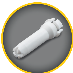
X-nozzle X1 F5-X