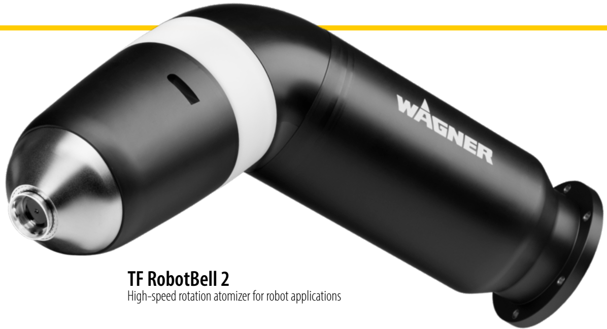
TF RobotBell 2 High-speed rotation atomizer for robot applications