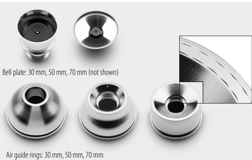
Bell plate: 30 mm, 50 mm, 70 mm (not shown)