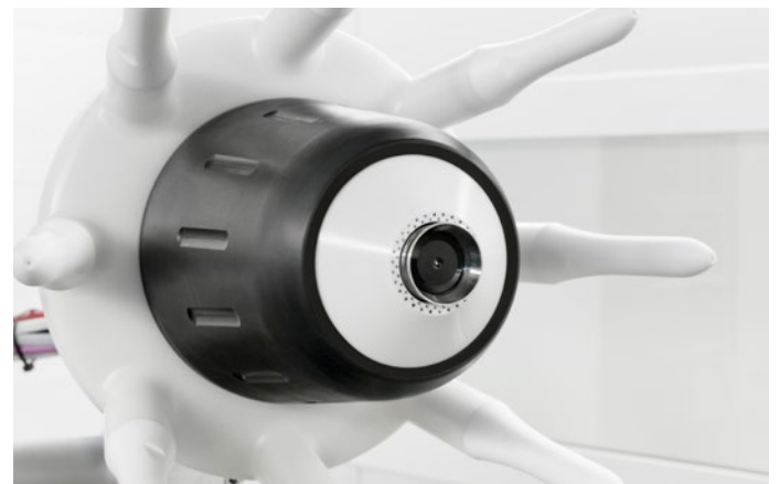
Bell plate 28 mm