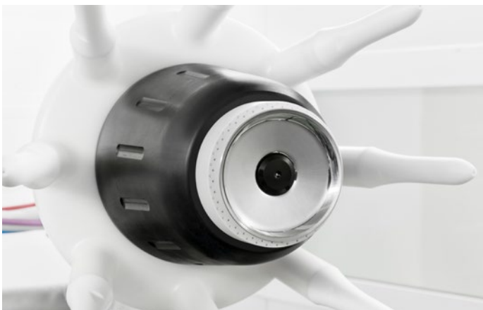
Bell plate 60 mm