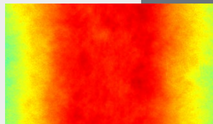
Dynamic spray pattern

Depending on the shape and size of the workpiece and the type of material, the appropriate bell cup size and serration can be selected. This results in a spray pattern range from 80 to 800 mm. The spray jet width can be adjusted extremely precisely.