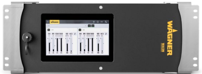
WACON Spray Modular control system for integration into a wide variety of coating systems