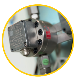
Gear flow meter