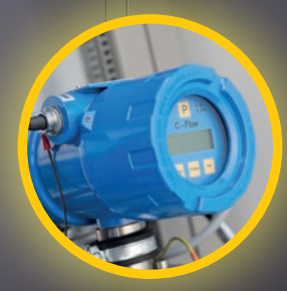
Coriolis flow meter