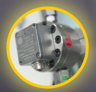
Gear flow meter Fast reaction time

WAGNER can generate the right solution for you from two different systems for material flow measurement. You can choose between the gear flow meter and Coriolis flow meter. These two measurement systems can also be combined in one system.