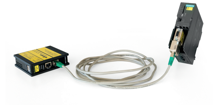
Connection to PLC with MPI interface MPI Ethernet adapter required for LAN connection