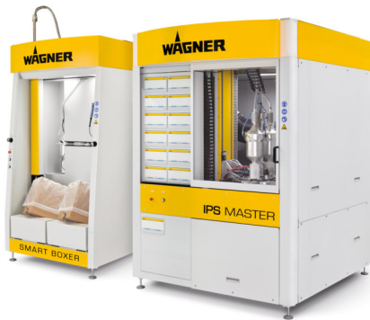
IPS coating center