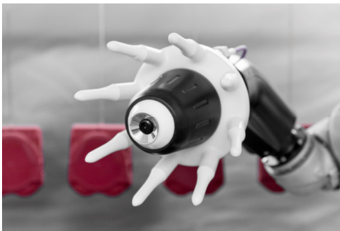
High-speed rotation atomizer TOPFINISH RobotBell 1 ECH with external charge