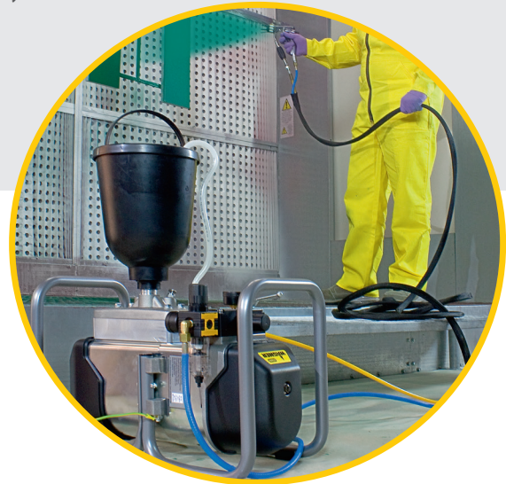
GM 4700AC Cobra 40-10 Hopper 5L Spray Pack Part # 2342248

Cobra® is a high-pressure double diaphragm pump suitable for Airless and AirCoat applications up to 250 bar/3,625 psi. Cobra® is the first high-pressure pneumatic pump without packings. The absence of friction in the fluid section and the minimum shear make it perfect for any kind of material including the most critical ones such as reactive paints (UV paints, isocyanate's, acrylics) or highly abrasive materials. The pump works with extremely low pulsation and creates a uniform paint flow, achieving a perfect spray pattern and superb surface quality.