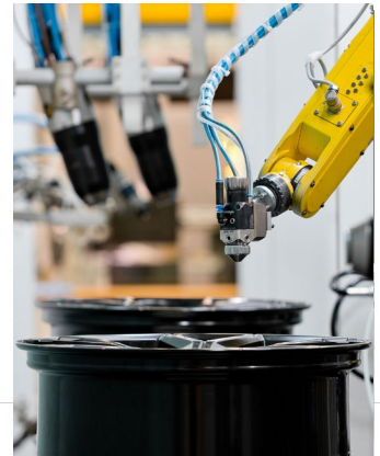
FOR THE INDUSTRY

WAGNER is a market-leading manufacturer of high-tech systems and components for the application of paints and powders and various liquid media to surfaces. The WAGNER portfolio also includes the processing of liquid performance materials such as adhesives and sealants. WAGNER surface technologies are used by consumers, the professional trade and industry alike – from small, handy paint sprayers and professional equipment up to complex industrial coating systems.